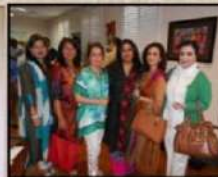
Let's vote Pakistan, consulate of Pakistan, Houston, USA August 14 th 2013