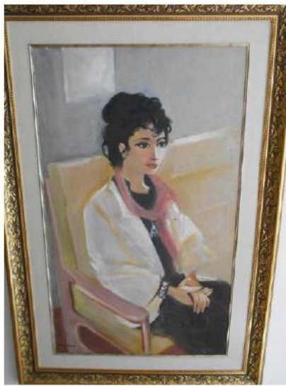
Mansoor A 50X30 oil on canvas 1987