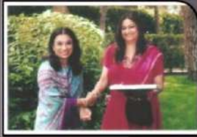
Meeting with Princess Sarwat, Jordan, 2008