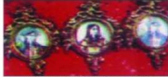
THE ART GALLERY