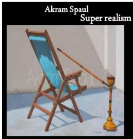
Akram Spaul Super realism