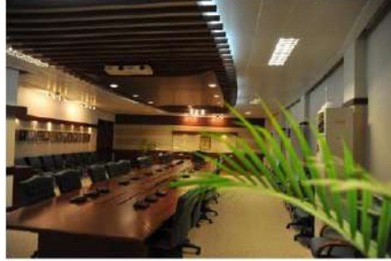
Furniture by Maroofa Alam