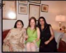
Tea with editor of paperback magazine in, Houston, USA