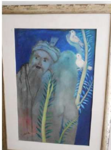
Tasadduq Sohail 2.5X2 Oil on Canvas