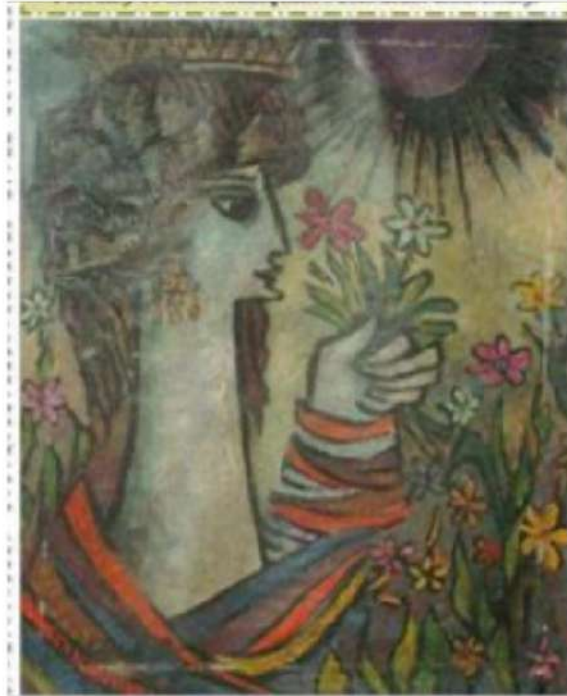
Sadequain 3.5X3 Oil on canvas 1973