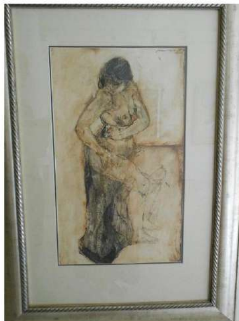
Jmail Naqsh 24X20 Oil on Paper 1984