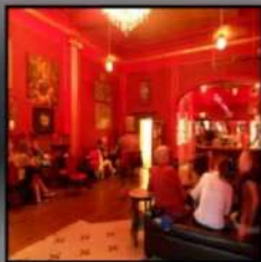
Exhibition in Fort Collins, July 2013, Colorado